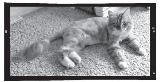
Shot with a deer hunting arrow, Xena has recovered nicely and is enjoying life as a pampered kitty.

Xena was a pretty little stray kitty who had been shot with a deer hunting arrow. It took 3 days to catch the scared kitty. Once captured, the arrow still through her body, she was rushed to Belair Veterinary Hospital for emergency surgery and then came to Rude Ranch to recover. She was soon adopted and moved to Towson to live in a high rise condo.