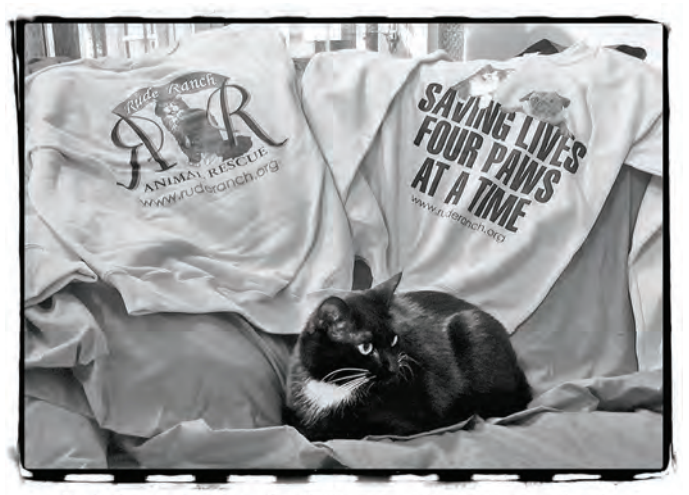
Rude Ranch and Spay Spa T-Shirts and Sweatshirts make the purr-fect holiday gifts. (Sorry, Stewie not included!)