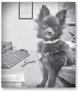
Raven helps at the clinic.

We've formed partnerships with several rescue groups and humane societies such as The Humane Society of Washington County, Tip Me Frederick, Cats R Us, Mutts Matter, Dogs XL, Toy Breeds in Need, Road Runner Rescue, and The Humane Society of Somerset County.