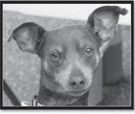
Bunny is ready to meet-and-greet at all of her favorite government agencies

a Rude Ranch CFC video! The Rude Ranch CFC video is available on the Rude Ranch website (www.ruderanch.org/ ruderanchcfc-2010.mp4) Once again Rude Ranch is