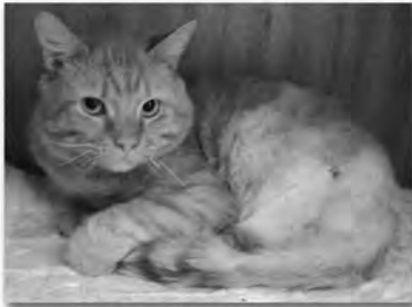
BuBu Tiger is FIV positive and doing well at Rude Ranch.

Like Feline Leukemia (FELV), FIV is a retrovirus that affect a cat's immune system. Neither virus is transmittable to humans or other animals. The FIV virus is spread mainly through blood contact such as cat fights and bites. Unlike the FELV virus, the FIV virus can not easily cross mucous membranes (the mouth, eyes, nose etc). While the FIV virus does affect a cat's immune system, with proper care and diet many FIV positive cats live a normal lifespan. (The average lifespan of an FIV positive cat at Rude Ranch is 17 years!)