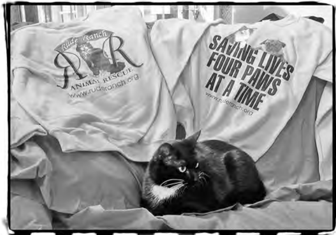
Show your support for animals along with Stewie by wearing a Rude Ranch or Spay Spa & Neuter Nook T-Shirt or Sweatshirt