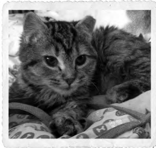
Cuddles was the perfect name for this little lap cat.

Throughout the summer and into the fall, Cuddles' littermates grew into active cats, but Cuddles didn't grow. She still wanted to curl up and cuddle. Her humans knew something wasn't right.