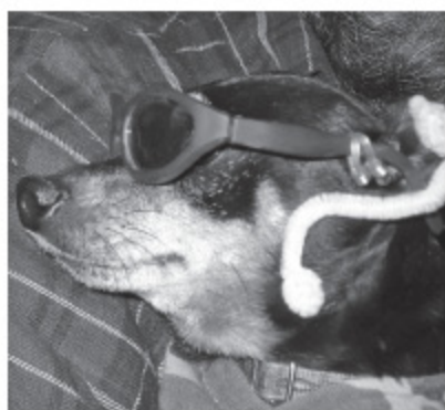
Boomer shows off his spiffy spy gear

Many of you may remember him as one of the greeters at Rude Ranch in his earlier years. He then became our official fundraising dog and attended most of our events with the federal and state governments. He hobnobbed with Commissioners, NFL Hall of Famers and even raided the FBI cafeteria once. He took the part of Santa's Elf to help deliver presents to pre school kids at Christmas time. People would see him and instantly be drawn to him. We never had to "work the crowd" when Boomer was with us; one look at him and people flocked