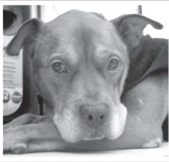
From lost to loved, Big Red the Pitbull gets a new chance at a happy life.

business" quickly and wanted to go back to his kennel, where he promptly fell asleep. Several days later, we noticed a difference in Big Red. His cuts and bruises were healing. He didn't have as much trouble getting up after a nap. He walked with a little spring in his step and actually seemed to enjoy himself. Soon, the spots of mange were gone and his bald patches started to fill in. Not only did Big Red enjoy his walks, he happily trotted from tree to tree, sniffing, exploring