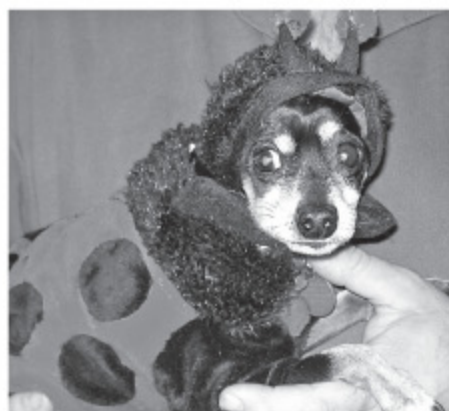
What a cute little bug Boomer makes!

From the time we found him in the middle of a country road until the end of his life, he was our best friend.