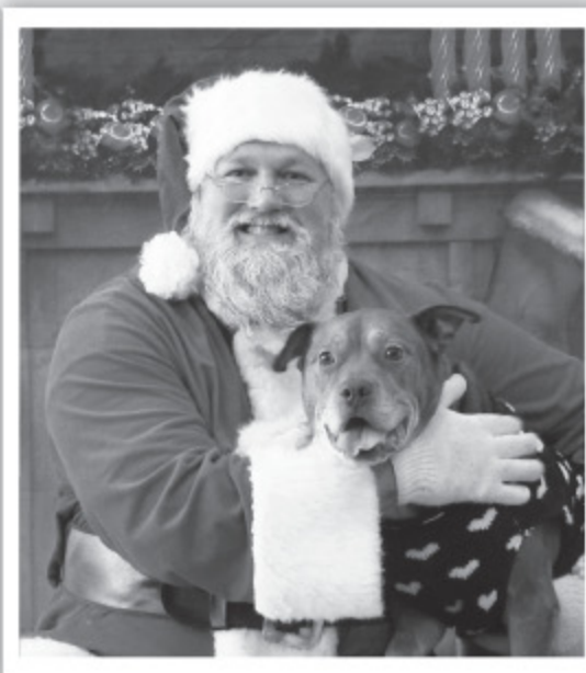
Big Red has his photo taken with Santa, "smiling" for the camera