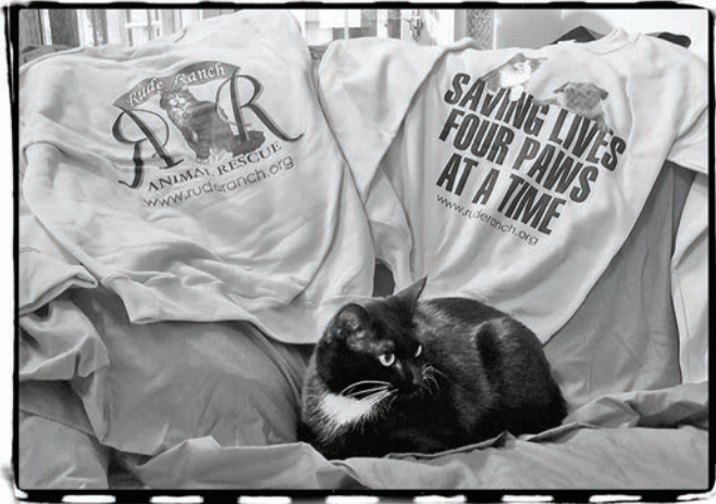
Show your support for animals by wearing a Rude Ranch or Spay Spa & Neuter Nook T-Shirt or Sweatshirt