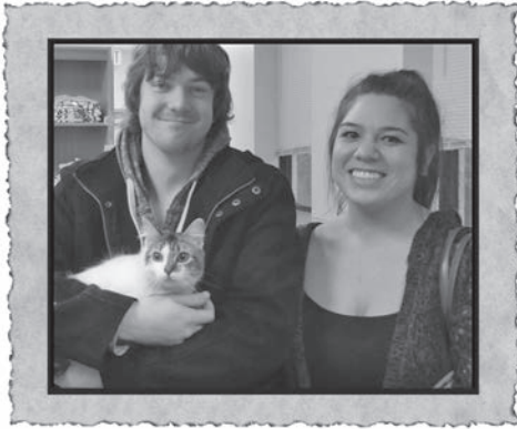
A 9-month old kitty named Kitana was our 10,000th surgery patient.

The Spay Spa & Neuter Nook, Rude Ranch's High Quality, Low Cost spay/neuter clinic hit a milestone in performing our 10,000th surgery in March. That works out to 7,009 cats, 2,935 dogs, 53 rabbits, 2 guinea pigs and an opossum! We hit the magic number the morning of March 26. A then 9 month old long haired kitty named Kitana was number 10,000.