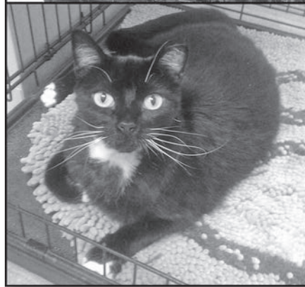
Life is much happier without a bottle stuck on his head