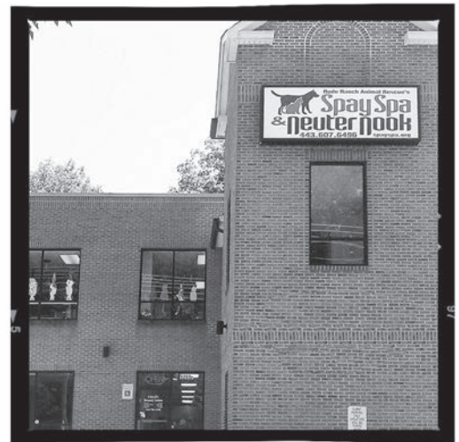
The Spay Spa and Neuter Nook in Davidsonville, MD

Construction started in July. So far there have been no surprises or unexpected delays. We plan to start using the new space in December. Please join us in our effort to help more animals by becoming