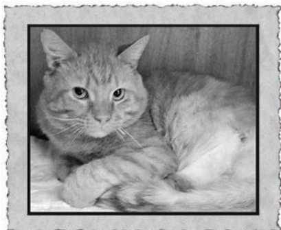
After a life of neglect, BuBu Tiger is ready for a loving home of his own!

BuBu Tiger, a sweet orange tiger cat with a huge purr and an even bigger personality was featured in our Spring Mewsletter. He was brought to the Spay Spa & Neuter Nook from a farm in rural Somerset County, MD. Unfortunately, he arrived with a badly broken leg and a massive infection. The only way to help him was to amputate the leg. Despite being in a lot of pain, BuBu still purred and rubbed on the side of the carrier.