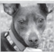
Bunny the min pin is ready to work!

If you've never heard of the Combined Federal Campaign (CFC), the Maryland Charity Campaign (MCC) or the United Way, here's how it works: If you work for the federal government, Maryland State government, or a Maryland County government, you can pick one (Rude Ranch) or several charities to donate to through payroll deduction. Once you designate Rude Ranch, your agency will deduct your tax deductible specified amount from your paycheck and send it to Rude Ranch. Your generous donations through CFC, MCC and the United Way help us provide