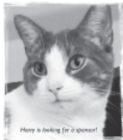
Henry is looking for a sponsor!

Want to help a homeless animal, but can't take one more in? Sponsor a Rude Ranch long-term resident instead! Your tax deductible sponsorship of a Rude Ranch long-term resident for just $20 a month (67¢ a day) will provide food, kitty litter and toys for one of our special needs cats. The cats in this program include feral and abused cats, HIV positive and FELV positive cats. Right now most of our HIV cats have sponsors, but a lot of the feral and abused cats are in need. When you sponsor a cat, you'll receive an adoption certificate with pictures of your chosen cat and its history. We will proudly display a picture of your cat with your name as the cat's sponsor on our website. You can even make an appointment to come visit your "virtual adoptee" anytime. For more information, visit our website at www.ruderanch.org and click on "Sponsor A Resident". Or email rrn@ruderanch.org .