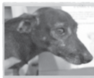
JackJack gets ready to ride!

JackJack is a 16 pound Dachshund that was in the news last spring. He was found wandering in the weeds on the side of the road in Crownsville, MD. Worried that he would be hit by a car, a caring person picked him up, and not knowing what else to do, took him to the county animal control shelter. Part of animal control's standard animal intake procedure is to scan for a microchip. Imagine the officer's surprise when it turned out that not only did this little dog have a microchip, but he had been reported missing/stolen over 4 years ago from an Army Base in North Carolina!