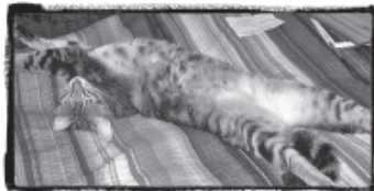
Racer chills out in California

Storm made the trip from Baltimore to Las Vegas with no problems (although he did have a slight accident somewhere over Utah) and slept in bed with his family his first night home (after a bath). Racer had a slightly longer trip to Sacramento, CA (and still didn't like airport security) but also was very happy to land in his new digs and be with his person.