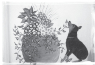
Former Rude Ranch Mascot, Boomer, is remembered in a mural at the Sanctuary