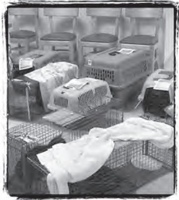
Spay Spa & Neuter Nook helps to control the overpopulation of feral cats

and animal control agencies are brought in to “dispose” of the cats. However, if the original cats can be trapped, fixed and released back to the area, usually a mutually beneficial “agreement” is made where the cats are allowed to live in the area and are fed. The business benefits from the cats rodent control expertise. This concept is known as “TNR,” or Trap/Neuter/Release.