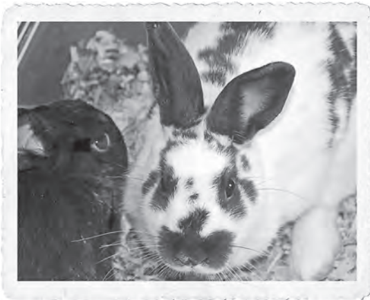
These former Easter bunnies are now safe, healthy, and happy in their new homes