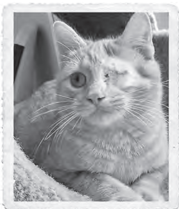
One-Eyed Jack is looking for a loving home of his own

I was one of several cats that showed up at Rude Ranch recently just after my nearby house burned down. In addition to being neutered (at Rude Ranch’s own Spay Spa & Neuter Nook), My left eye was misformed and badly infected and it needed to be removed. During my recovery they found out that if you scratch my right ear, I fall over and purr!