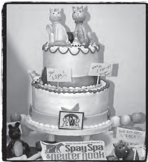
Tiffany's Bakery celebrated the Grand Opening in a very sweet way!